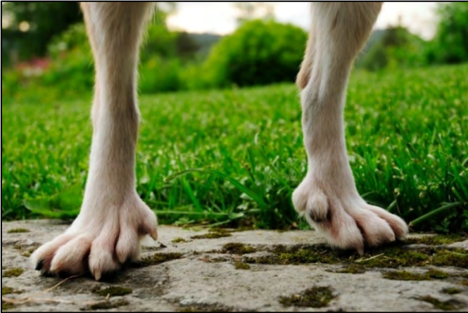
Fig. 33. Well developed hindfeet. The extra toes on the right hindfoot are especially excellent.