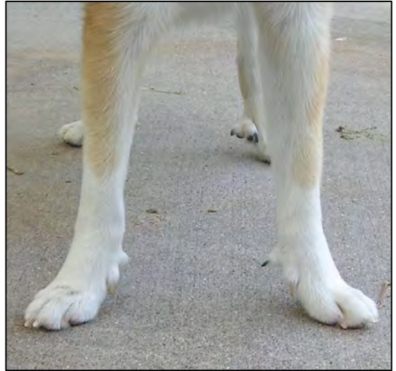
Fig. 23. This photo shows a dog with untypical extra toes. A dog with this kind of toes is not champion quality.