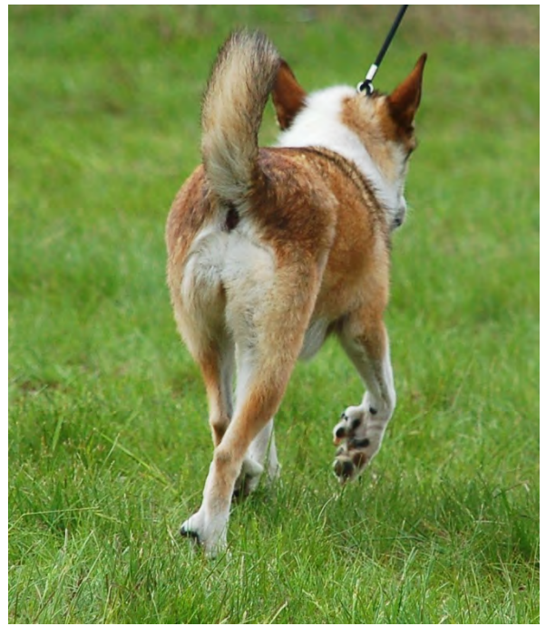
Fig. 39. Typical narrow movement behind.