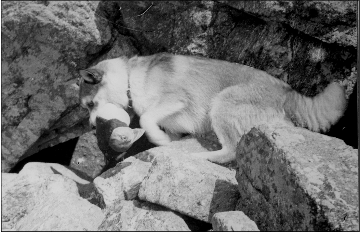
Fig. 3 – 4 Lunde dogs doing their job, - retrieving puffins.