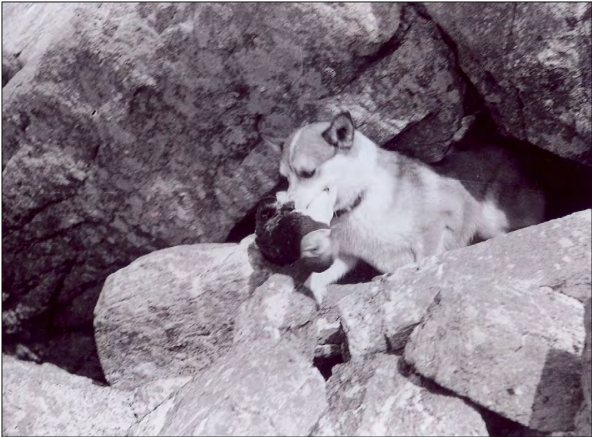
Fig. 10. A Norwegian Lundehund catching a puffin in a scree on Måstad. The picture is from 1972.