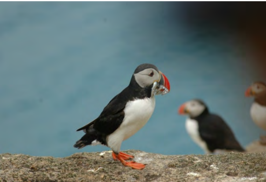
Fig. 12. A puffin with fish in the beak on its way to the nest to feed its chick after successful fishing in the sea. The puffin matures slowly and starts breeding at about 5 years of age. They only lay one egg. This is one of the reasons why they are so vulnerable.