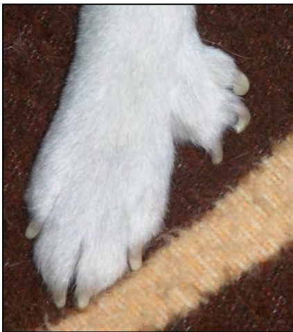
Fig. 26. More than six toes are acceptable, but six toes are preferred.