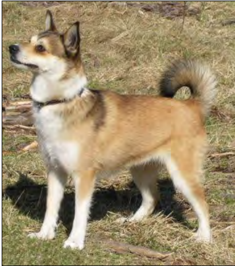
Fig. 14. A typical bitch with correct proportions and correct tail.