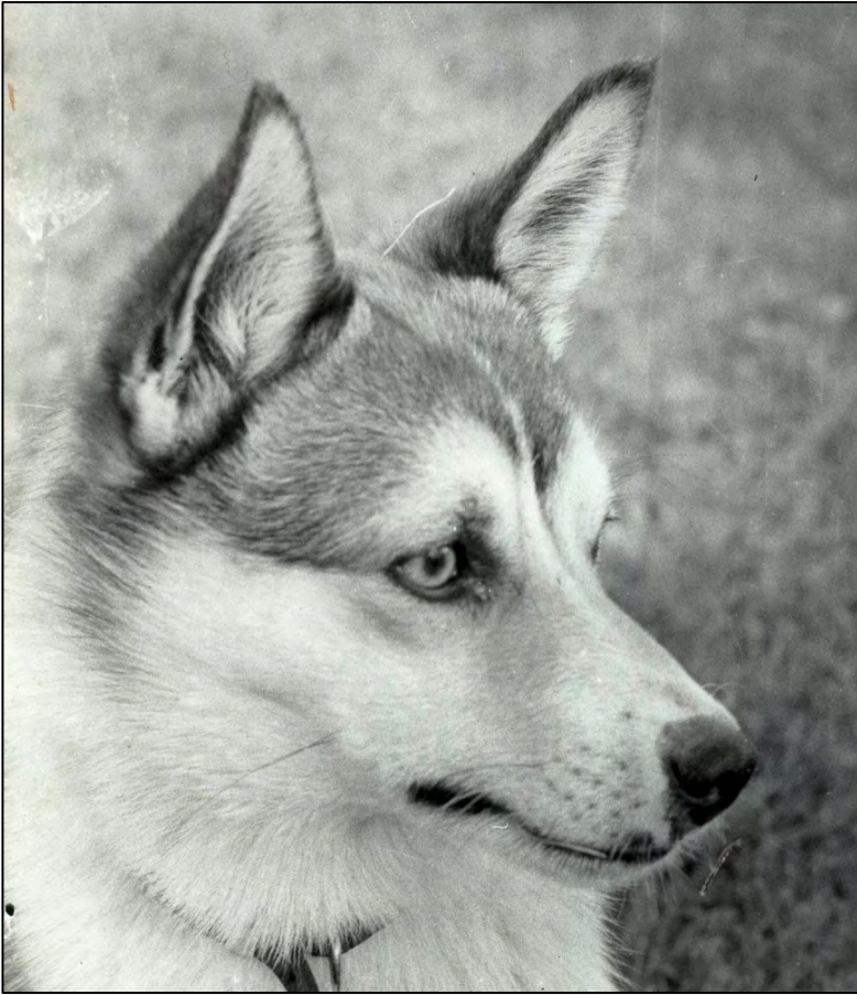
Fig.16. An excellent masculine head shape. Correct eye and under jaw. A very typical alert expression due to the rather light eye colour.