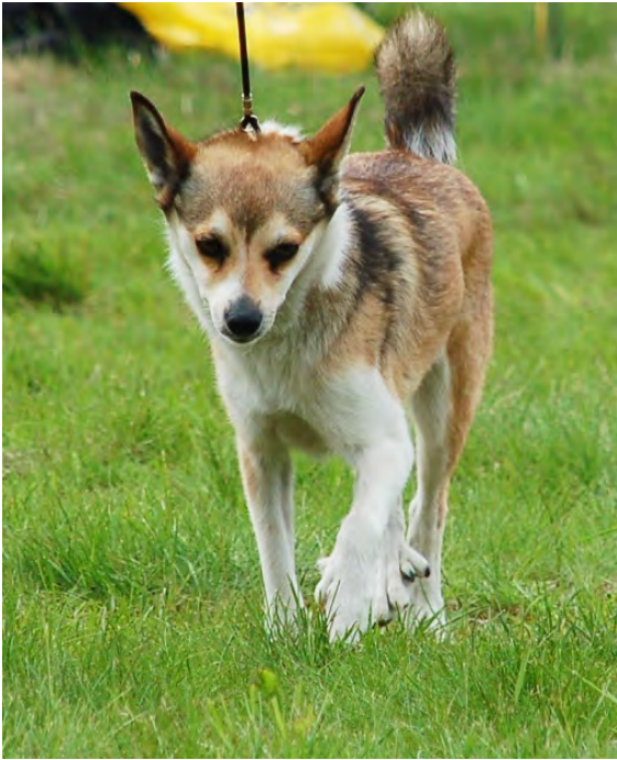
Fig. 38. Typical wide and rotating front movement.