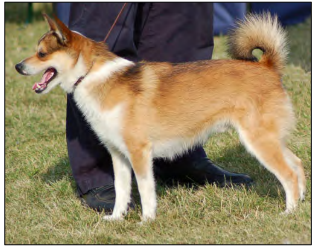
Fig. 29. A correct male with good proportions, and correct carried tail.