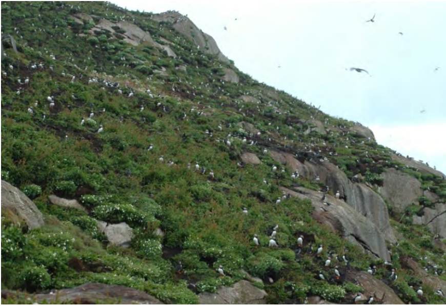
Fig 11. Puffins nesting in a steep scree. Today the birds are considered an endangered species and legally protected.