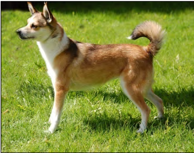
Fig. 28. A typical bitch, with correct tail