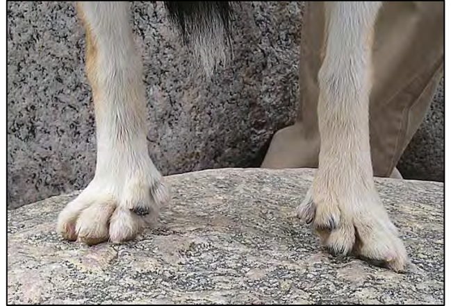
Fig. 34. Acceptable extra toes on hindfeet.