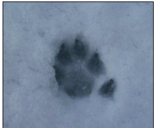
Fig. 27. A Lunde Hund track in snow.