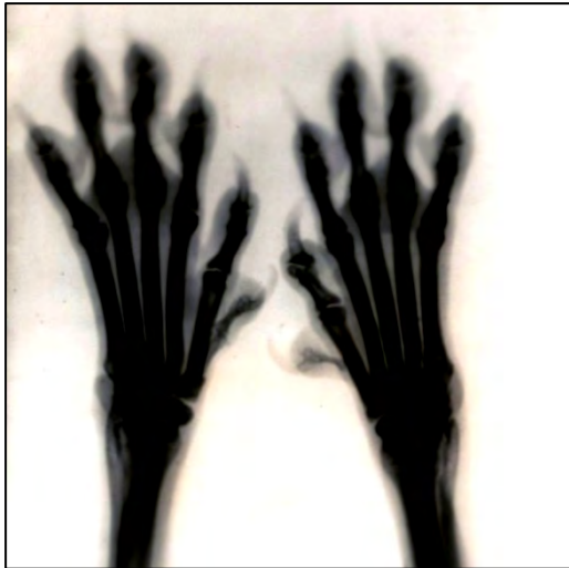
Fig. 24. X-ray of forefeet.