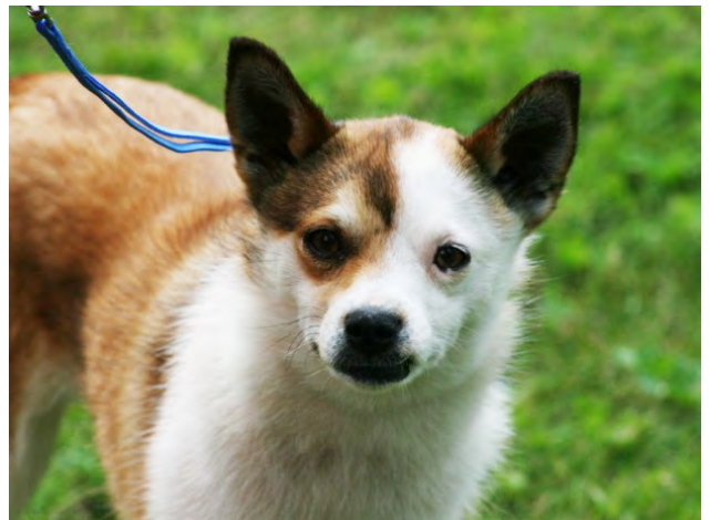
Fig. 41. A dog with this kind of markings, white around one or both eyes with no pigmentation, is not preferred and cannot get excellent.