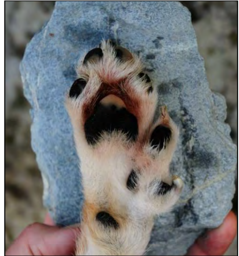
Fig. 25. Excellently developed extra toes.