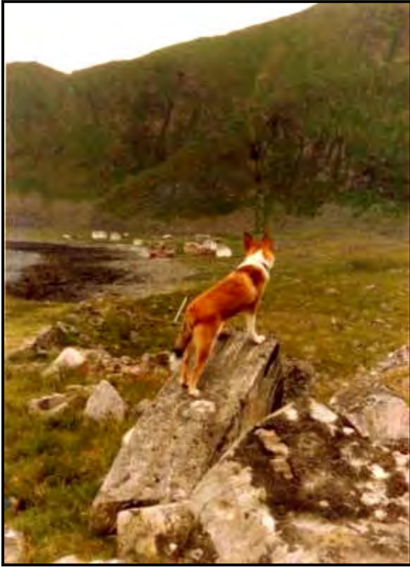
Fig. 5. Måstad approx. 1983.