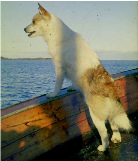
Fig. 40. This photo shows a dog with acceptable white colour.