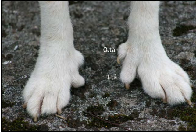
Fig. 22. Excellently developed extra toes.