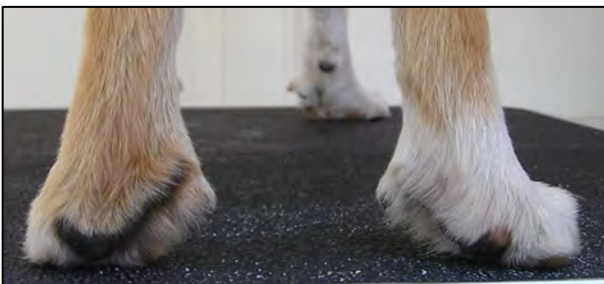
Fig. 37. The pads on the hindfeet are visible from behind when the dog stands on level ground. The dog only puts weight on its toes.