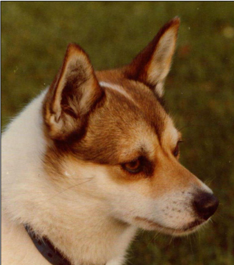
Fig. 17. A feminine head of excellent type.