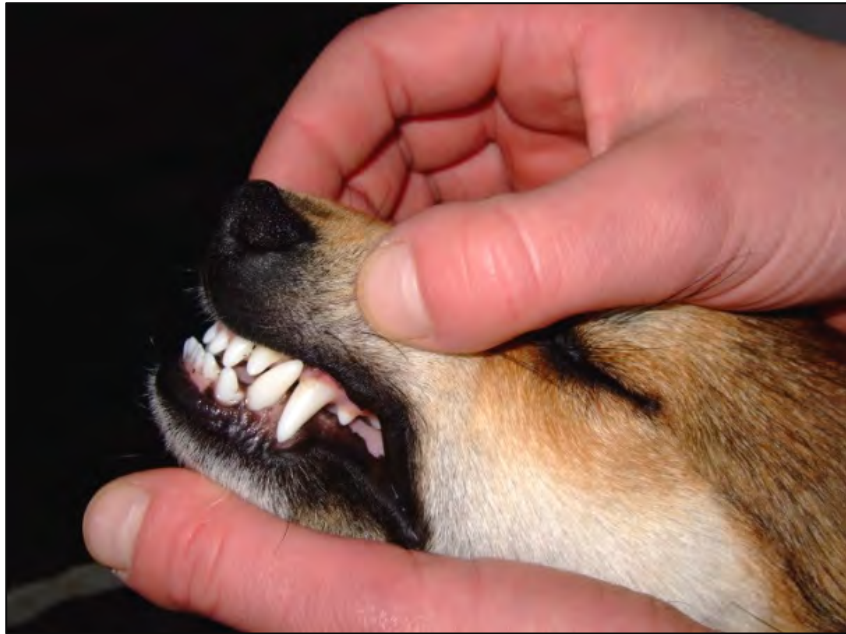
Fig. 18. An acceptable undershot.