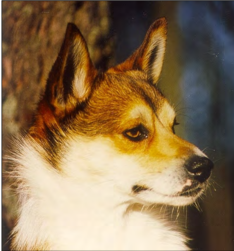
Fig. 20. A masculine head with correct eye openings.