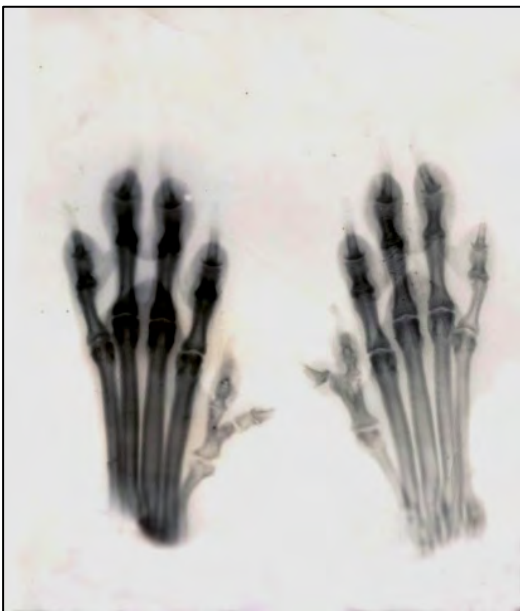
Fig. 35. X-ray of hindfeet.