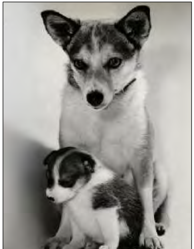
Fig. 9. The bitch Eir with her five weeks old puppy, Tussa. Eir is the ancestress of all of today's Lundehunds.

The Norwegian Lundehund club was founded in 1962 by a group of enthusiasts, and great and important work was done to save the breed. Especially thanks to Eleanor Christie, we can today say that the breed is saved from extinction. Earlier, before WWII, there were also black (tricolours) and white Lundehunds, but these colours are no longer to be seen.