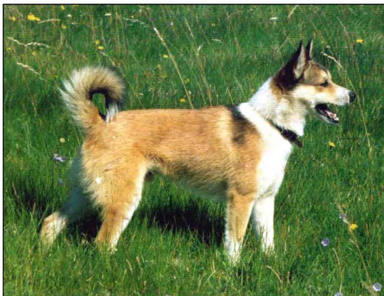
Fig. 15. A typical male with correct proportions and correct tail.