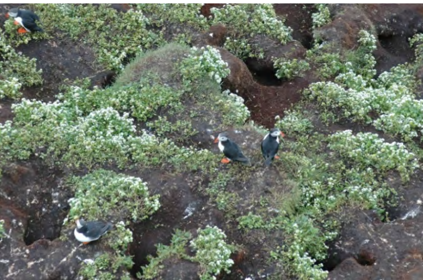
Fig. 13. The puffins' nests are in passages they dig in the peat, or in caverns in scree.